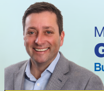
Matthew GUY Bulleen District